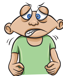
Nervous or upset

If low blood sugar is not treated, it can become severe and cause you to pass out. If low blood sugar is a problem for you, talk to your doctor or diabetes care team.