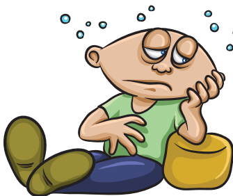
Weak or tired